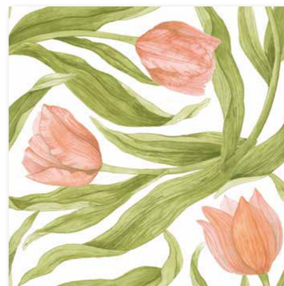
TULIPS DUSTY PINK ART NO: 2025-15

100% PAPER, 40x40 CM, 50 PSC AND 24x24 CM 40 PSC