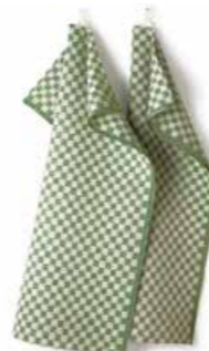
DARK GREEN ART NO: 2025-33