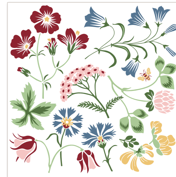
SJU BLOMSTER ART NO: 2026-12