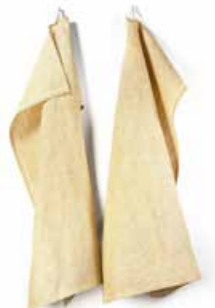
OCHRE ART NO: 2023-06