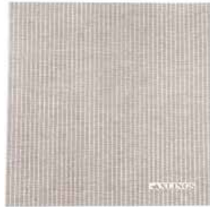
NATURAL ART NO: 2011-45

PAPER NAPKIN KRITSTRECK LARGE, DINNER 40x40 CM, SET OF 50