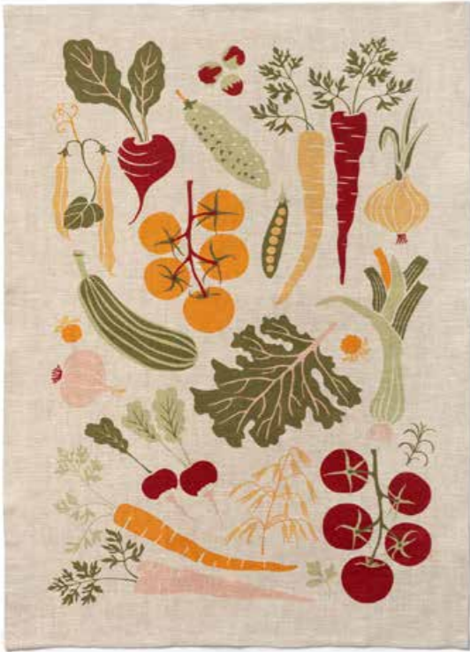
MULTI COLOR ART NO: 2026-26