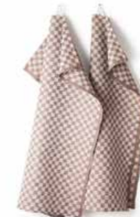
BROWN ART NO: 2015-10