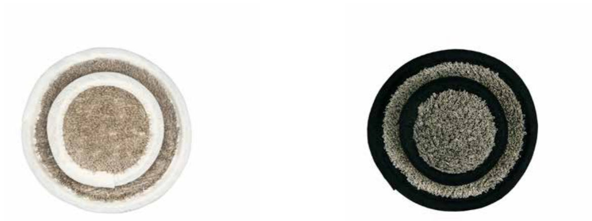
NATURAL-OFFWHITE ART NO: 682 - SMALL ART NO: 684 - BIG