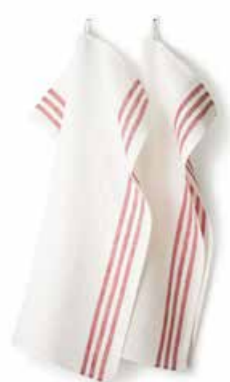
RED ART NO: 2017-15

< Twill weave classic tea/kitchen towels in 100% linen that will look great in any kitchen. Diagonal come in 6 different colors in sets of 2.