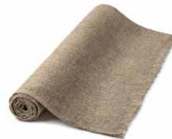
NATURAL ART NO: 2026-17