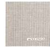
NATURAL ART NO: 2017-29

SMALL, COFFEE - COCKTAIL, 24x24 CM, SET OF 40