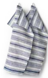
OFFWHITE – MARINE ART NO: 2024-07