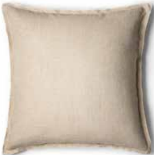
NATURAL ART NO: 2026-10