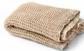
CRÈME ART NO: 2025-12