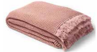
DUSTY PINK ART NO: 2025-14