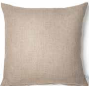
NATURAL ART NO: 2023-34

CUSHION COVER GÅRD 100% WASHED LINEN, 43x43 CM AND 58x60 CM WITH ZIPPER