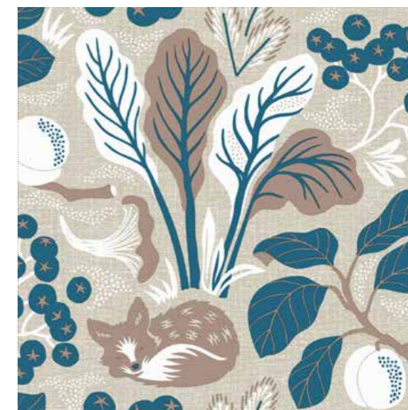
MARINE-BROWN-NATURAL ART NO: 2025-31