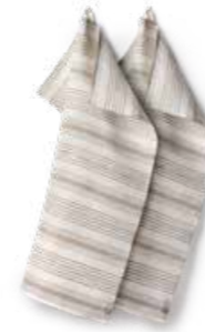
OFFWHITE – NATURAL ART NO: 2024-01