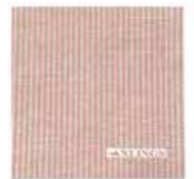
DUSTY PINK ART NO: 2025-17