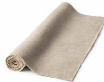
NATURAL ART NO: 2026-09