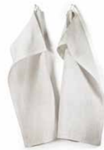
NATURAL ART NO: 2023-01