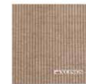
BROWN ART NO: 2026-28