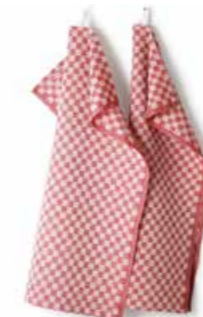
RED ART NO: 20095-48