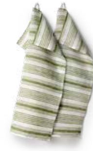
OFFWHITE – GREEN ART NO: 2024-05