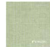
GREEN ART NO: 2017-01