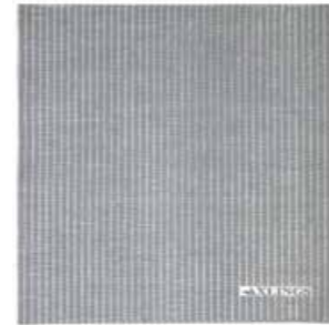
CONCRETE ART NO: 2018-24