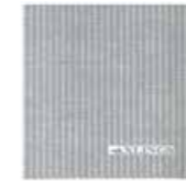
CONCRETE ART NO: 2018-22