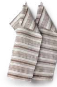
OFFWHITE – BROWN ART NO: 2024-03