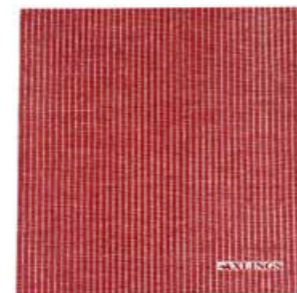
RED ART NO: 2011-67