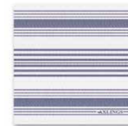
MARINE ART NO: 2024-47