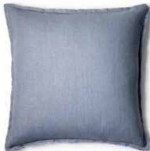
DUSTY BLUE ART NO: 2026-08

CUSHION COVER GÅRD 100% WASHED LINEN, 43x43 CM AND 58x60 CM WITH ZIPPER