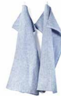
MARINE ART NO: 2023-07