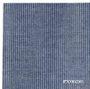
MARINE ART NO: 2011-46