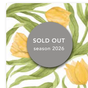
TULIPS YELLOW ART NO: 2026-03