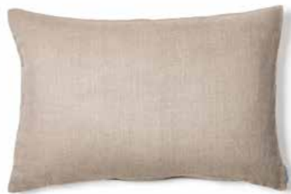
NATURAL ART NO: 2023-35

CUSHION COVER MERSMAC 100% LINEN 47x47 CM