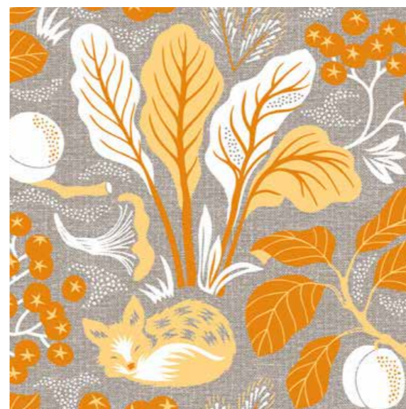
ORANGE-OCHRE-BROWN ART NO: 2025-30