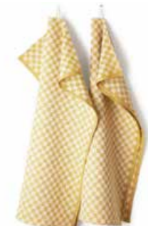
OCHRE ART NO: 2018-50