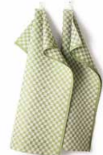
GREEN ART NO: 2013-08