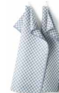
DUSTY BLUE ART NO: 2026-25