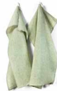
GREEN ART NO: 2023-05