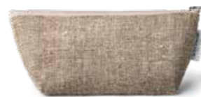
NATURAL SMALL, 10x26 CM ART NO: 2023-39