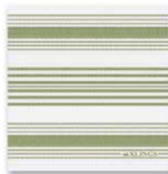
GREEN ART NO: 2024-46