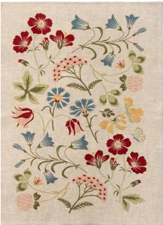
MULTI COLOR ART NO: 2026-25