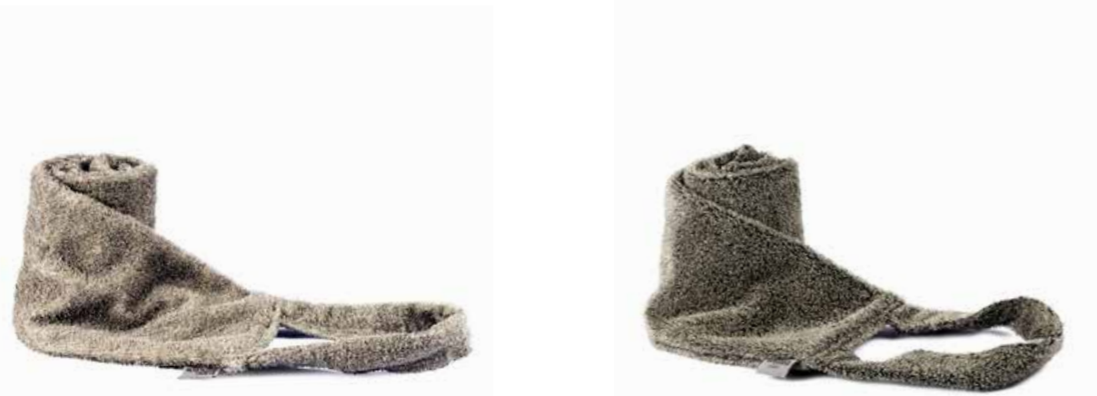
NATURAL-OFFWHITE ART NO: 618