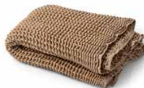
NATURAL ART NO: 2025-11