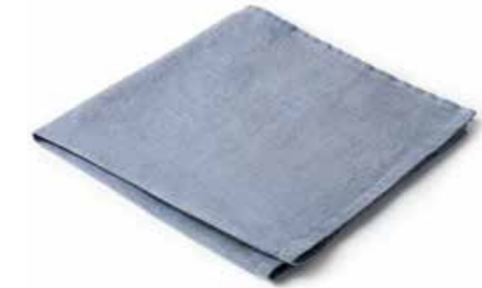
DUSTY BLUE ART NO: 2026-06