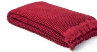
RED ART NO: 2024-60

< Big sized throws 200 cm long in 100% organic cotton. Here in natural and green. These fluffy plaids are perfect inside on the bed or couch, or outside in the garden.