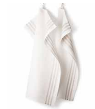
NATURAL ART NO: 2017-14