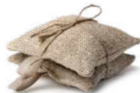
NATURAL 12x12 CM ART NO: 2024-43