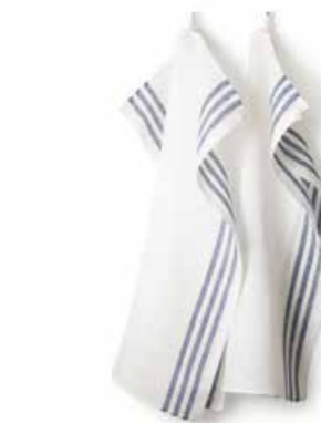
MARINE ART NO: 2017-13