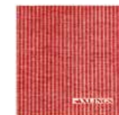
RED ART NO: 2017-39