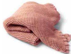
DUSTY PINK ART NO: 2025-10