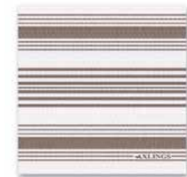
BROWN ART NO: 2024-45