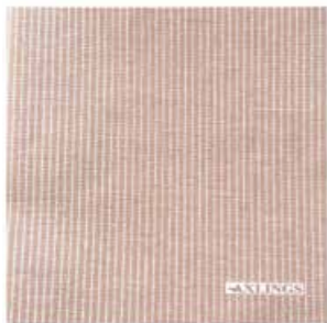
DUSTY PINK ART NO: 2025-16