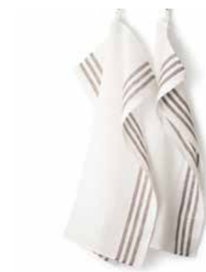
BROWN ART NO: 2017-40