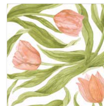
TULIPS DUSTY PINK ART NO: 2026-01