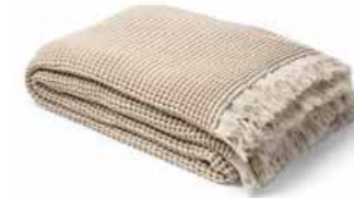
CRÈME ART NO: 2025-07