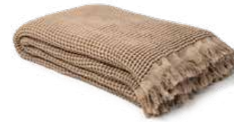
NATURAL ART NO: 2024-58