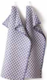
MARINE ART NO: 20095-41