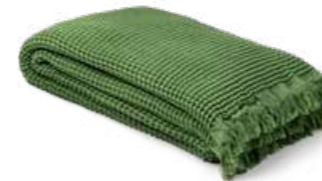
GREEN ART NO: 2024-59