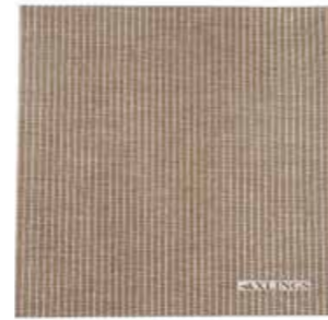
BROWN ART NO: 2018-25