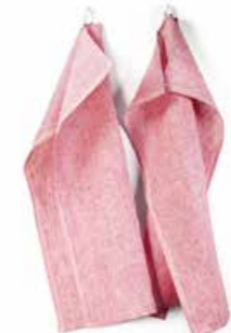
RED ART NO: 2023-08