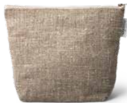
NATURAL BIG, 20x26 CM ART NO: 2023-38