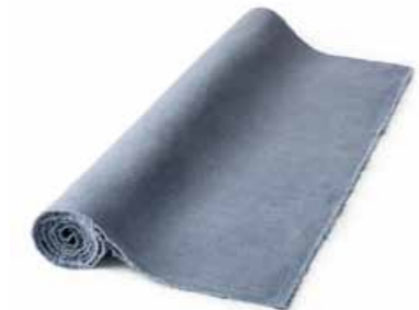
DUSTY BLUE ART NO: 2026-07