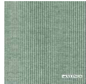
DARK GREEN ART NO: 2025-26