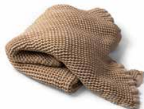
NATURAL ART NO: 2025-08