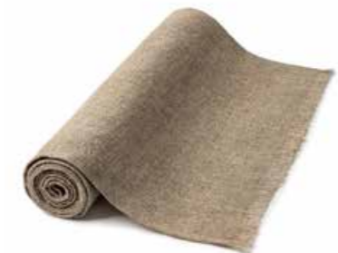
NATURAL ART NO: 2026-16