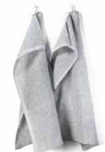
CONCRETE ART NO: 2023-02