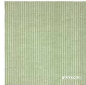
GREEN ART NO: 2026-33