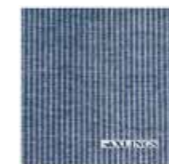
MARINE ART NO: 2017-03