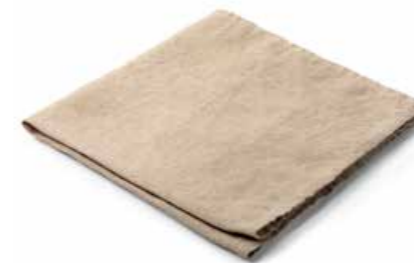
NATURAL ART NO: 2024-66