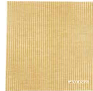
OCHRE ART NO: 2018-59