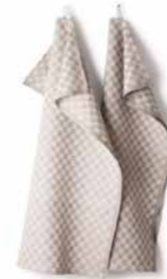
NATURAL ART NO: 20095-46

KITCHEN TOWEL SCHACK 53% LINEN 47% COTTON, 50x70 CM, SET OF 2