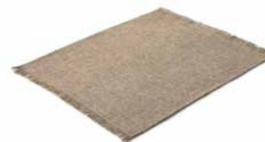
NATURAL ART NO: 2026-18