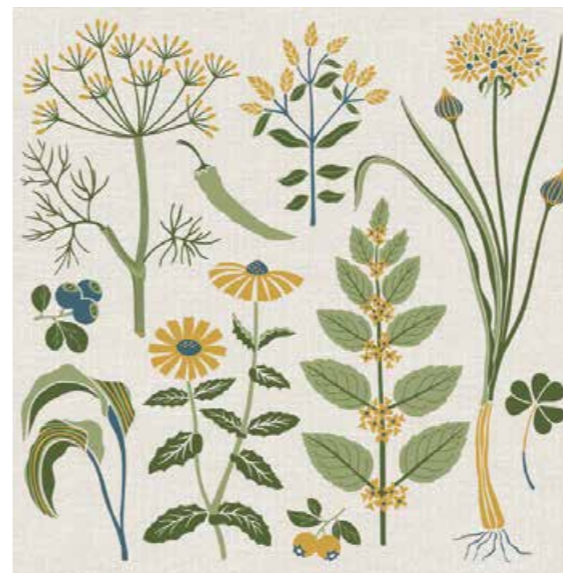
MULTI COLOR ART NO: 2026-35