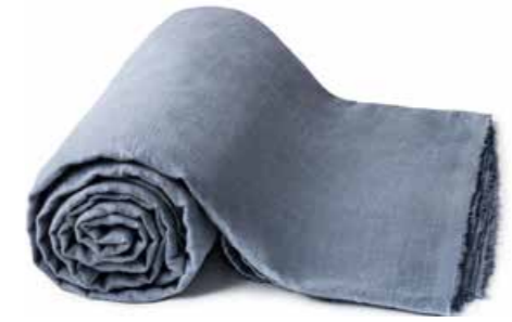
DUSTY BLUE 165x250 ART NO: 2026-04 165x320 ART NO: 2026-05