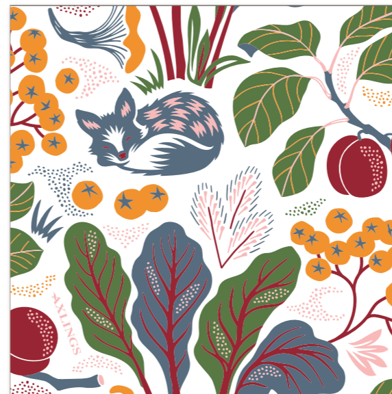
MULTI COLOR ART NO: 2026-11