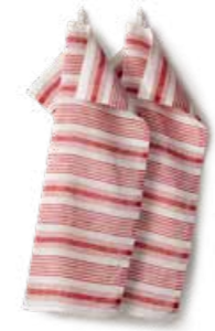
OFFWHITE – RED ART NO: 2024-08