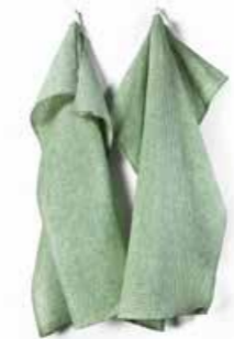
DARK GREEN ART NO: 2025-35