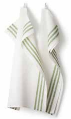
GREEN ART NO: 2017-12