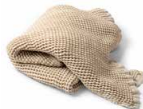
CRÈME ART NO: 2025-09