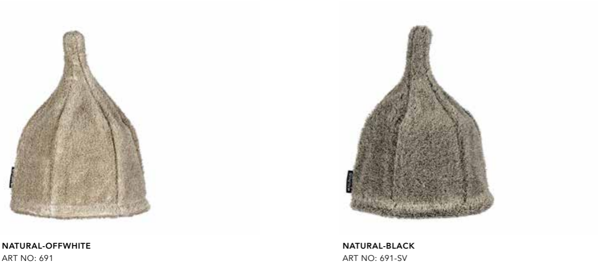
NATURAL-OFFWHITE ART NO: 691