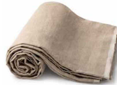
NATURAL 165x250 ART NO: 2024-64 165x320 ART NO: 2024-65