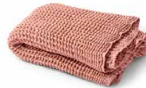
DUSTY PINK ART NO: 2025-13