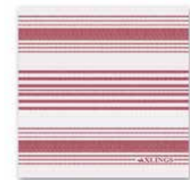
RED ART NO: 2024-48

< Axlings kitchen towel Gästabud marine, brown, green and natural. 100% linen towels in sets of two. Perfect as glass towels, or why not as generous napkins? The pattern is also inspired by old traditional Swedish bolstervar stripes. These towels in big numbers will do the trick when setting a table for any special event.