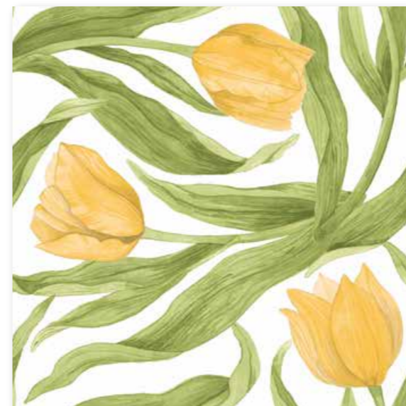
TULIPS YELLOW ART NO: 2026-02

100% PAPER, 40x40 CM, 50 PSC AND 24x24 CM 40 PSC