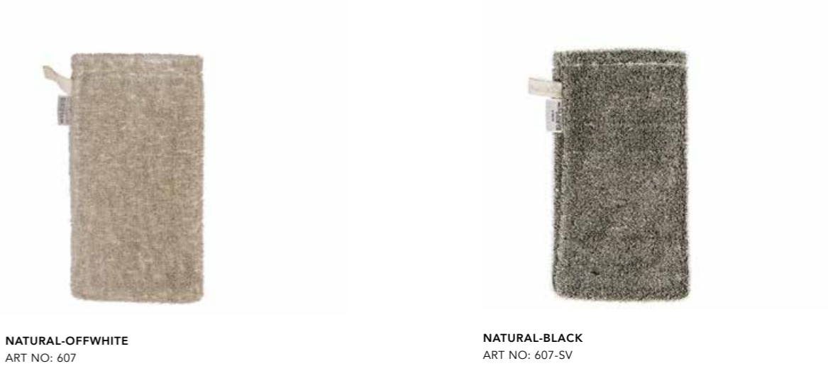
NATURAL-OFFWHITE ART NO: 607