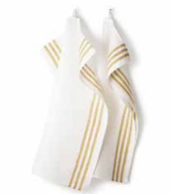
OCHRE ART NO: 2018-51