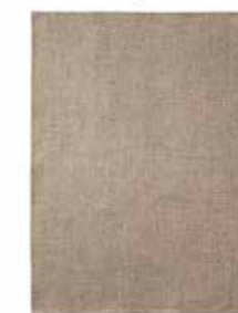
NATURAL ART NO: 2026-19