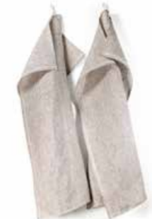
BROWN ART NO: 2023-04