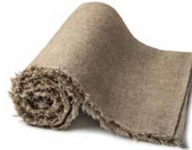
NATURAL 150x250 ART NO: 2026-04 150x320 ART NO: 2026-05