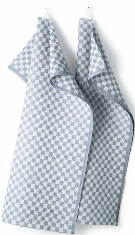
DUSTY BLUE ART NO: 2026-25