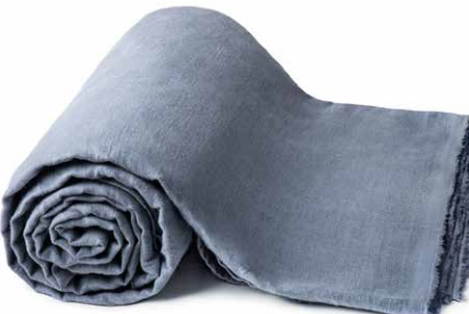
DUSTY BLUE 165×250 ART NO: 2026-04 165×320 ART NO: 2026-05