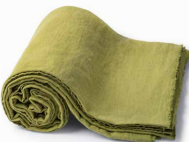
CARDAMOM SEED GREEN 165×250 ART NO: 2025-01 165×320 ART NO: 2025-02