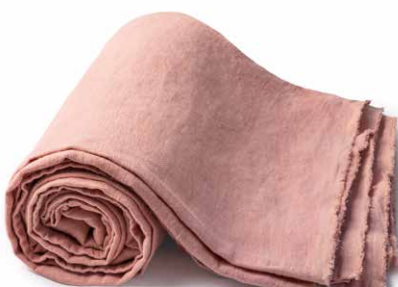
DUSTY PINK 165×250 ART NO: 2025-03 165×320 ART NO: 2025-04