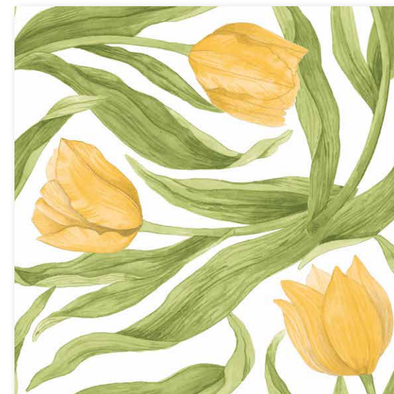
TULIPS YELLOW ART NO: 2026-02

100% PAPER, 40×40 CM, 50 PSC AND 24×24 CM 40 PSC