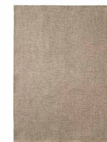
NATURAL ART NO: 2026-19

< Placemat Robust natural and papernapkin Blårask.