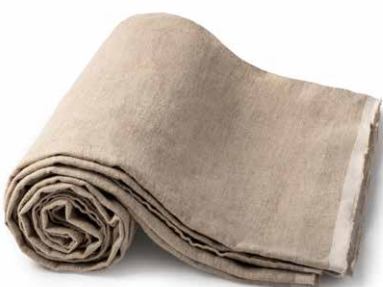
NATURAL 165×250 ART NO: 2024-64 165×320 ART NO: 2024-65