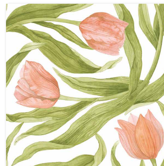
TULIPS DUSTY PINK ART NO: 2025-15

100% PAPER, 40×40 CM, 50 PSC AND 24×24 CM 40 PSC