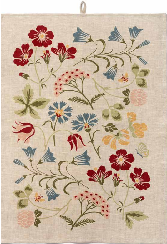
MULTI COLOR ART NO: 2026-25