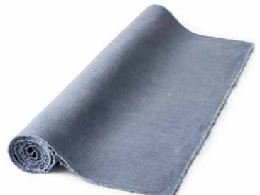
DUSTY BLUE ART NO: 2026-07