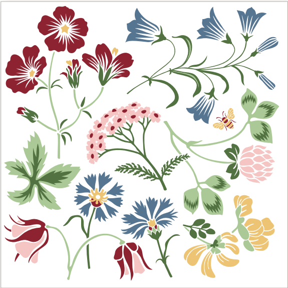
SJU BLOMSTER ART NO: 2026-12