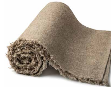
NATURAL 150×250 ART NO: 2026-04 150×320 ART NO: 2026-05