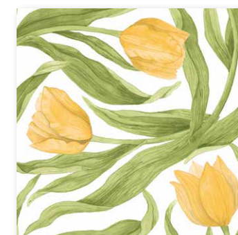
TULIPS YELLOW ART NO: 2026-03