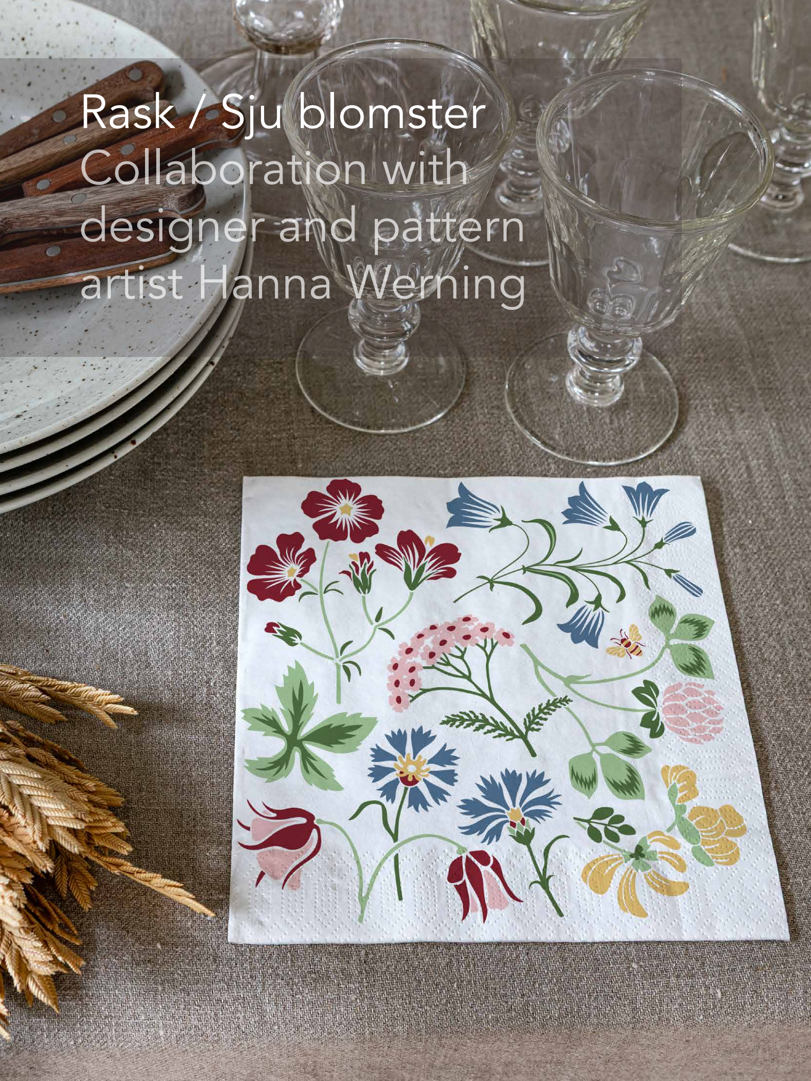
PAPER NAPKIN MULTIRASK 100% PAPER, 40×40 CM, 50-PACK