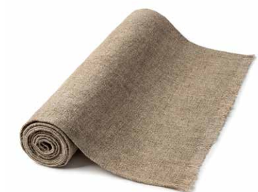
NATURAL ART NO: 2026-16