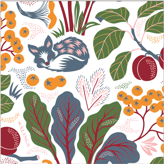
MULTI COLOR ART NO: 2026-11