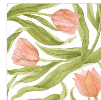
TULIPS DUSTY PINK ART NO: 2026-01

< Papernakin Tulips yellow on top of tablecloth Boheme dusty pink.