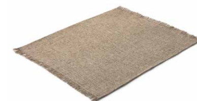
NATURAL ART NO: 2026-18