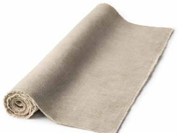
NATURAL ART NO: 2026-09