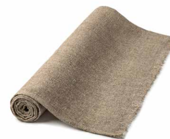
NATURAL ART NO: 2026-17