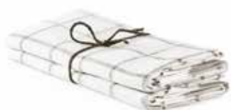
NATURAL RT NO: 2017-20

KITCHEN TOWEL KÖKSUTA 100% LINEN, 50×70 CM, SET OF 2