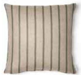
NATURAL – GREEN ART NO: 2023-26