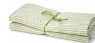
GREEN ART NO: 2023-05