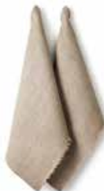
NATURAL ART NO: 2023-17

< Layering linen. Tablecloth Linåker as the base layer. Placemat Burlap layered on top. Linåker towel under the bowl along with a spruce twig. Rolled up in the bowl on top as the last layer is our napkin Gärd.