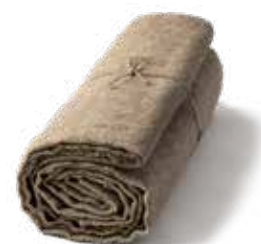
BROWN 138×250 ART NO: 2024-27 138×320 ART NO: 2024-28