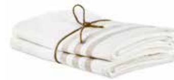
NATURAL ART NO: 2017-14