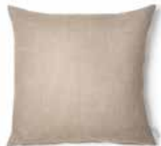
NATURAL ART NO: 2023-34

100% WASHED LINEN, 43×43 CM AND 40×60 CM WITH ZIPPER