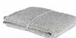
NATURAL-MARINE ART NO: 2023-48