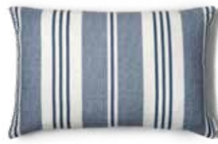
OFFWHITE - MARINE ART NO: 2024-12