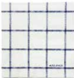
MARINE ART NO: 2019-42