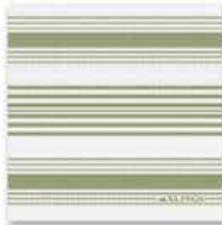
GREEN ART NO: 2024-46