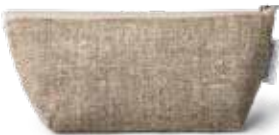
NATURAL SMALL, 10x26 CM ART NO: 2023-39