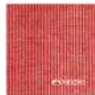
RED ART NO: 2017-39