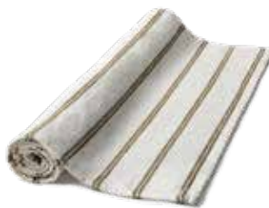
OFFWHITE – BROWN ART NO: 2024-22