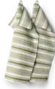
OFFWHITE – GREEN ART NO: 2024-05