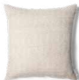
NATURAL – OFFWHITE ART NO: 2024-17