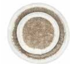
NATURAL-OFFWHITE ART NO: 682 – SMALL ART NO: 684 – BIG