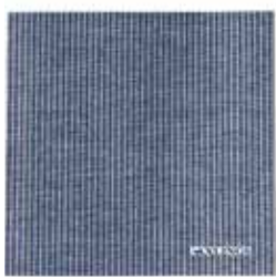
MARINE ART NO: 2011-46