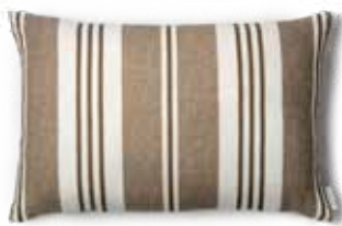
OFFWHITE - BROWN ART NO: 2024-10