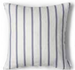
OFFWHITE – MARINE ART NO: 2024-16

< A basket full of Axlings red and natural coloured cushion cases along with a red waffle throw, redy to be displayed for the autumn- and winter seasons.