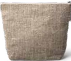
NATURAL BIG, 20x26 CM ART NO: 2023-38