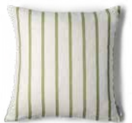
OFFWHITE – GREEN ART NO: 2024-15