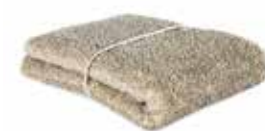
NATURAL-OFFWHITE ART NO: 2023-42