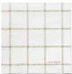
NATURAL ART NO: 2019-38

PAPER NAPKIN KÖKSruta 100% PAPER, 40×40 CM, 50-PACK