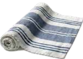
OFFWHITE – MARINE ART NO: 2024-36