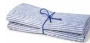
MARINE ART NO: 2023-07