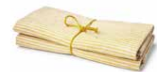
OCHRE ART NO: 2023-06