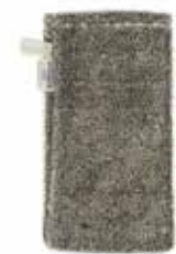
NATURAL-BLACK ART NO: 607-SV