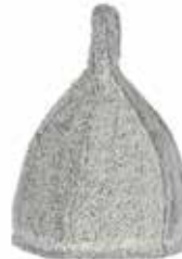
WHITE-BLACK ART NO: 666