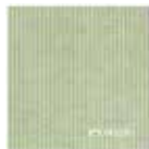
GREEN ART NO: 2017-01