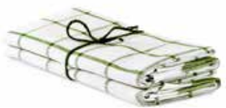
GREEN ART NO: 2017-18