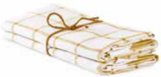
OCHRE ART NO: 2018-52