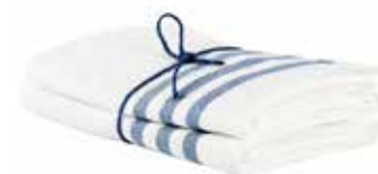
MARINE ART NO: 2017-13