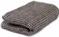
NATURAL-BLACK ART NO: 793-1