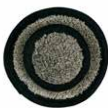
NATURAL-BLACK ART NO: 682-SV – SMALL ART NO: 684-SV – BIG