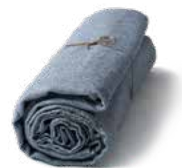
MARINE 138×250 ART NO: 2024-31 138×320 ART NO: 2024-32