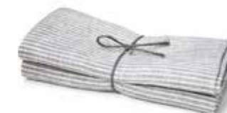
CONCRETE ART NO: 2023-02