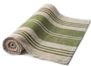
NATURAL – GREEN ART NO: 2024-41