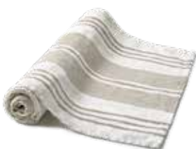
OFFWHITE – NATURAL ART NO: 2024-33