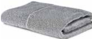
WHITE-BLACK ART NO: 2023-46