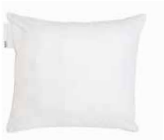
WHITE 50X50 ART NO: IN

100% COTTON AND GOOSE DOWN, 50×50 CM / 40×60 CM