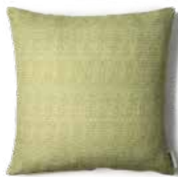
GREEN – OFFWHITE ART NO: 2024-19