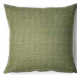
GREEN – NATURAL ART NO: 2024-56