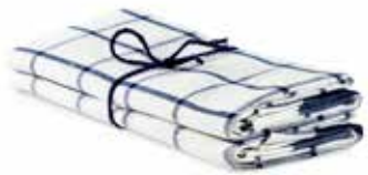
MARINE ART NO: 2017-19