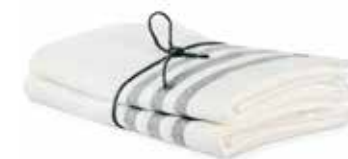
CONCRETE ART NO: 2017-11