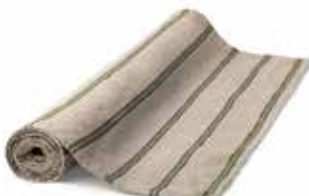
NATURAL – GREEN ART NO: 2023-20