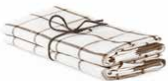
BROWN ART NO: 2017-41