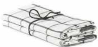
CONCRETE ART NO: 2017-17