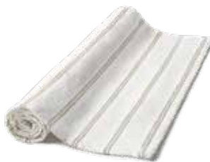
OFFWHITE – NATURAL ART NO: 2024-21