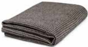
NATURAL-BLACK ART NO: 793-2