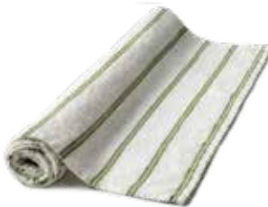
OFFWHITE – GREEN ART NO: 2024-23