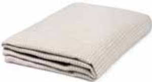
NATURAL-OFFWHITE ART NO: 791-2