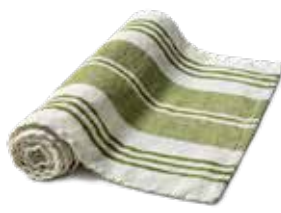
OFFWHITE – GREEN ART NO: 2024-35