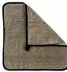
NATURAL-BLACK ART NO: 681-SV