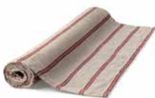
NATURAL – RED ART NO: 2023-19