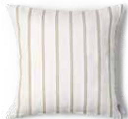
OFFWHITE – NATURAL ART NO: 2024-13