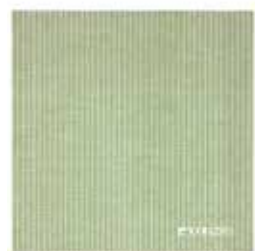
GREEN ART NO: 2014-04