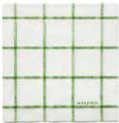
GREEN ART NO: 2019-37