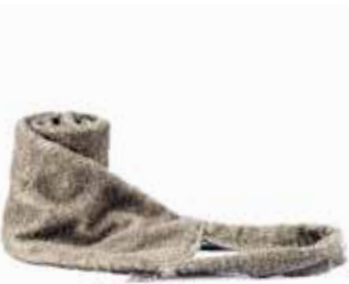
NATURAL-OFFWHITE ART NO: 618