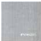
CONCRETE ART NO: 2018-22