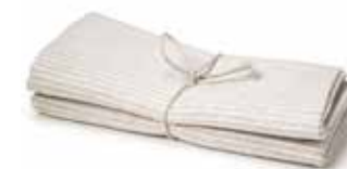
NATURAL ART NO: 2023-01