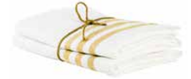
OCHRE ART NO: 2018-51