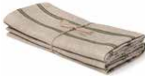
NATURAL – GREEN ART NO: 2023-16