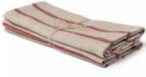
NATURAL – RED ART NO: 2023-15