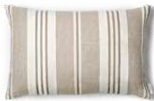
OFFWHITE - NATURAL ART NO: 2024-09