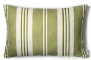
OFFWHITE - GREEN ART NO: 2024-11