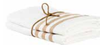
CINNAMON ART NO: 2023-11