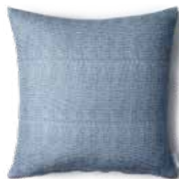
MARINE – OFFWHITE ART NO: 2024-20