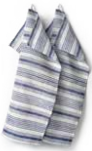
OFFWHITE – MARINE ART NO: 2024-07