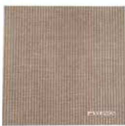
BROWN ART NO: 2018-25