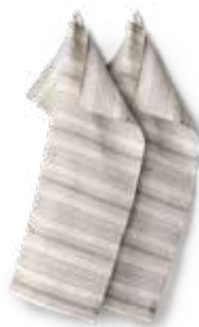
OFFWHITE – NATURAL ART NO: 2024-01

KITCHEN TOWEL GÄSTABUD 100% LINEN, 50×70 CM, SET OF 2