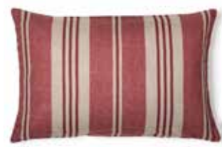
NATURAL - RED ART NO: 2023-30