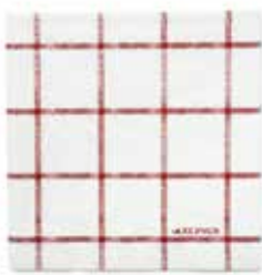
RED ART NO: 2019-35