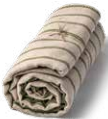
NATURAL – GREEN 138×250 ART NO: 2024-51 138×320 ART NO: 2024-52