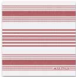
RED ART NO: 2024-48