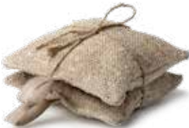
NATURAL ART NO: 2024-43