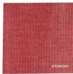
RED ART NO: 2011-67