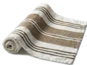
OFFWHITE – BROWN ART NO: 2024-34