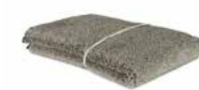
NATURAL-BLACK ART NO: 2023-45