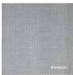
CONCRETE ART NO: 2018-24