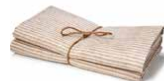
CINNAMON ART NO: 2023-03