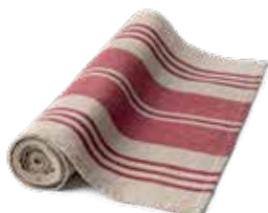
NATURAL – RED ART NO: 2024-42