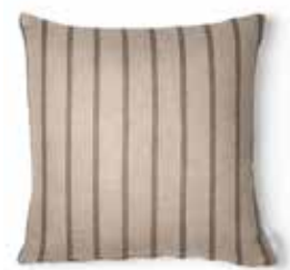
NATURAL – BROWN ART NO: 2023-25

CUSHION COVER LINÅKER 100% WASHED LINEN, 43x43 CM WITH ZIPPER