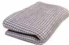
NATURAL-MARINE ART NO: 795-1