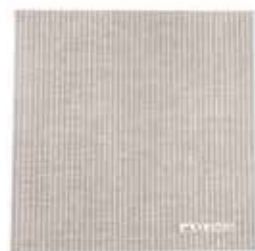
NATURAL ART NO: 2011-45