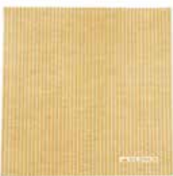
OCHRE ART NO: 2018-59