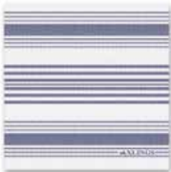
MARINE ART NO: 2024-47