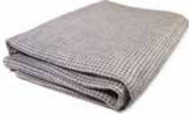
NATURAL-MARINE ART NO: 795-2