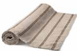
NATURAL – BROWN ART NO: 2023-18

RUNNER LINÅKER 100% WASHED LINEN, 44×140 CM