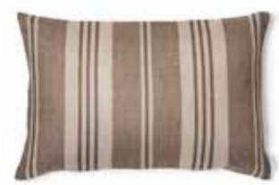
NATURAL - BROWN ART NO: 2023-28

CUSHION COVER VÄNDEG 100% WASHED LINEN, 38x60 CM WITH ZIPPER