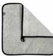
WHITE-BLACK ART NO: 665