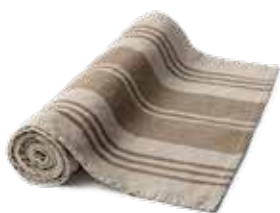
NATURAL – BROWN ART NO: 2024-40