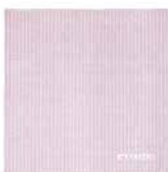
PINK ART NO: 2015-21