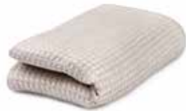
NATURAL-OFFWHITE ART NO: 791-1