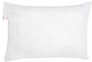
WHITE 40X60 ART NO: IN40X60