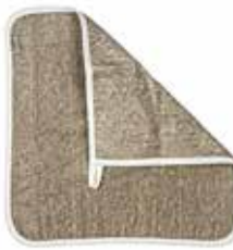
NATURAL-OFFWHITE ART NO: 681