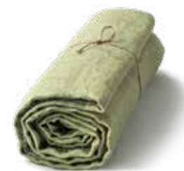
GREEN 138×250 ART NO: 2024-29 138×320 ART NO: 2024-30