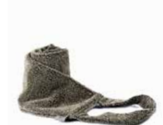
NATURAL-BLACK ART NO: 618-SV