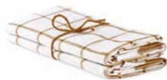
CINNAMON RT NO: 2023-12