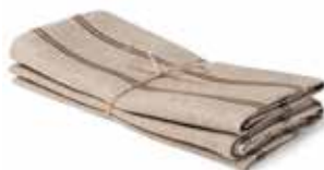
NATURAL – BROWN ART NO: 2023-14

KITCHEN TOWEL LINÅKER 100% WASHED LINEN, 50×70 CM, SET OF 2