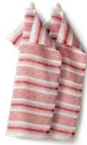
OFFWHITE – RED ART NO: 2024-08