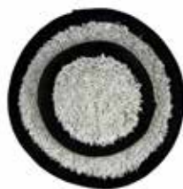
NATURAL-BLACK ART NO: 669 – SMALL ART NO: 670 – BIG