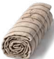
NATURAL – BROWN 138×250 ART NO: 2024-49 138×320 ART NO: 2024-50