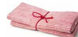
RED ART NO: 2023-08