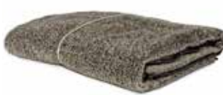
NATURAL-BLACK ART NO: 2023-44