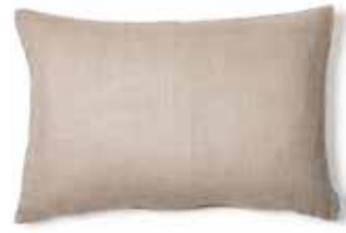
NATURAL ART NO: 2023-35

< Focus on incorporating as many textures as you can through cushions, throws, tablecloths and rugs. Use pillows in different shapes and sizes to add character to your space and drape throws over your sofa for extra warmth, especially during the colder months.