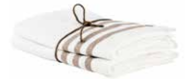
BROWN ART NO: 2017-40