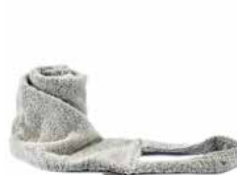
WHITE-BLACK ART NO: 667