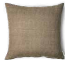
BROWN – NATURAL ART NO: 2024-55