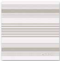
NATURAL ART NO: 2024-44

PAPER NAPKIN GÄSTABUD 100% PAPER, 40×40 CM, 50-PACK