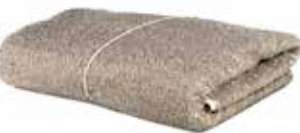
NATURAL-OFFWHITE ART NO: 2023-40