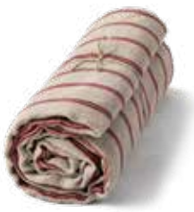
NATURAL – RED 138×250 ART NO: 2024-53 138×320 ART NO: 2024-54

KITCHEN TOWEL LINÅKER 100% WASHED LINEN, 50×70 CM, SET OF 2