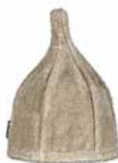
NATURAL-OFFWHITE ART NO: 691