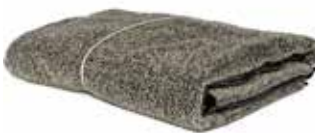
NATURAL-BLACK ART NO: 2023-43