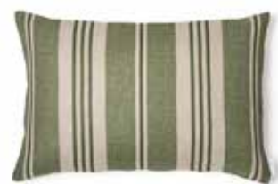
NATURAL - GREEN ART NO: 2023-29