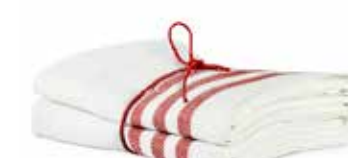
RED ART NO: 2017-15

< Classic tea/kitchen towels that will look great in any kitchen. They come in 8 different colors.