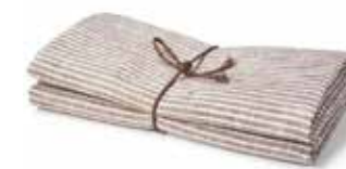
BROWN ART NO: 2023-04