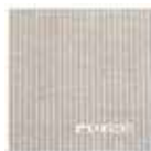
NATURAL ART NO: 2017-29

SMALL, COFFEE – COCKTAIL, 24x24 CM, SET OF 40