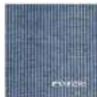
MARINE ART NO: 2017-03