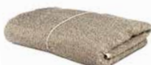
NATURAL-OFFWHITE ART NO: 2023-41