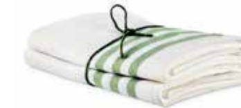
GREEN ART NO: 2017-12