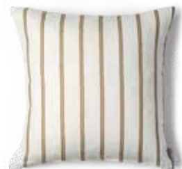
OFFWHITE – BROWN ART NO: 2024-14