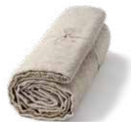
NATURAL 138×250 ART NO: 2024-25 138×320 ART NO: 2024-26

TABLECLOTH TRÄDA 100% WASHED LINEN, 138×250 CM / 138×320 CM