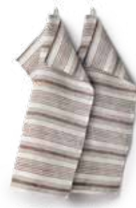
OFFWHITE – BROWN ART NO: 2024-03