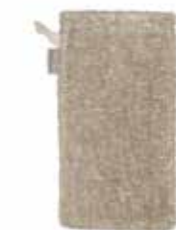
NATURAL-OFFWHITE ART NO: 607