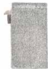
WHITE-BLACK ART NO: 664