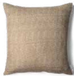
BROWN – OFFWHITE ART NO: 2024-18