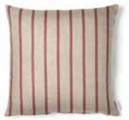
NATURAL – RED ART NO: 2023-27