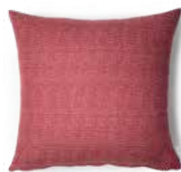
RED – NATURAL ART NO: 2024-57