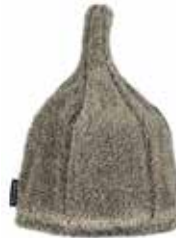
NATURAL-BLACK ART NO: 691-SV