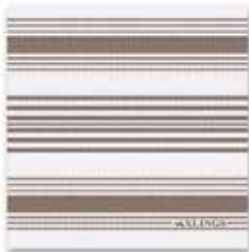
BROWN ART NO: 2024-45