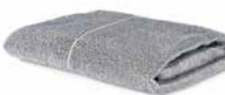
WHITE-BLACK ART NO: 2023-47