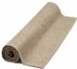
NATURAL ART NO: 2023-21