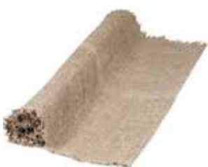
NATURAL ART NO: 2023-36