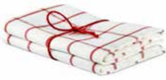
RED ART NO: 2017-21

< Axlings kitchen towels Köksruta in 100% linen with a wide border along the long sides. The weaving technique is plain weave and it provides a sturdy and robust towel that you can look forward to for decades.