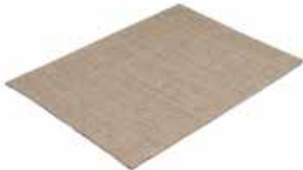
NATURAL ART NO: 2023-37