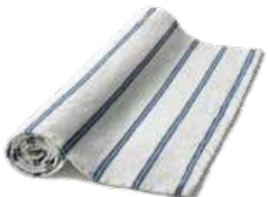
OFFWHITE – MARINE ART NO: 2024-24