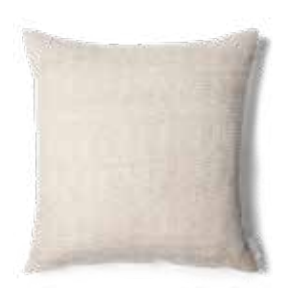
NATURAL – OFFWHITE ART NO: 2024-17