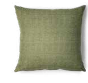
GREEN – NATURAL ART NO: 2024-56