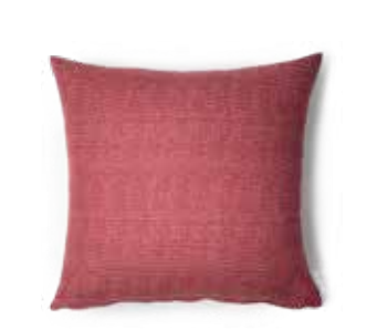
RED – NATURAL ART NO: 2024-57