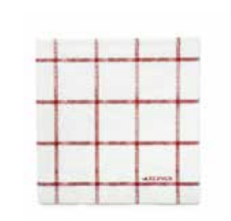
RED ART NO: 2019-35