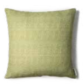
GREEN – OFFWHITE ART NO: 2024-19