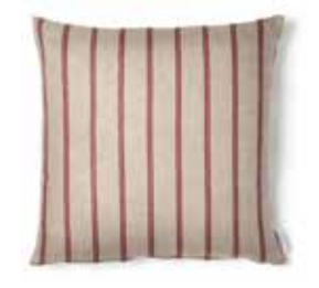
NATURAL – RED ART NO: 2023-27