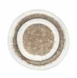
NATURAL-OFFWHITE ART NO: 682 – SMALL ART NO: 684 – BIG