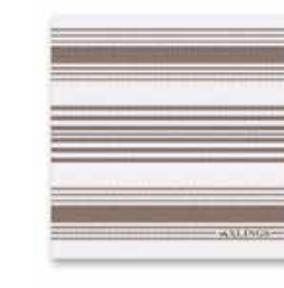
BROWN ART NO: 2024-45