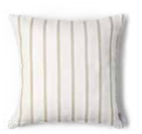
NATURAL – GREEN ART NO: 2023-26