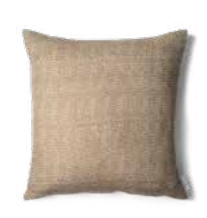
BROWN – OFFWHITE ART NO: 2024-18