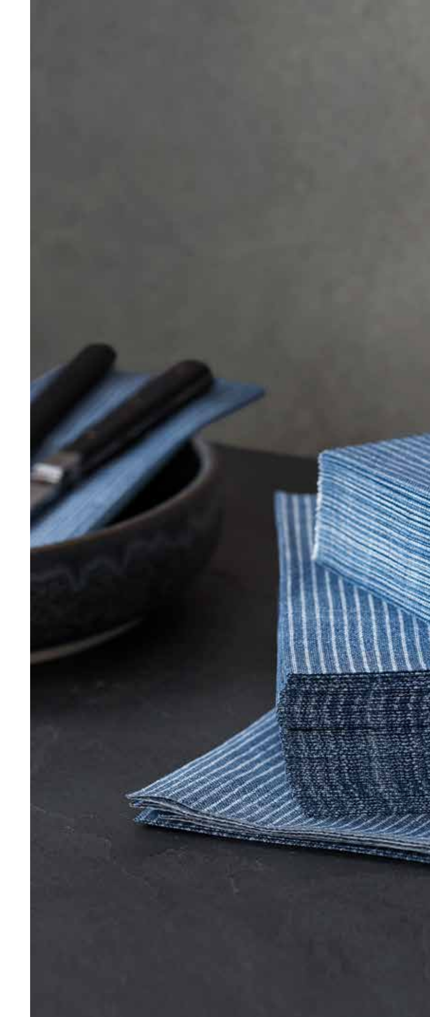
RED ART NO: 2017-39

> The Swedish word Kritstreck is Pinstripe or chalk stripe in English. Pinstripes are a pattern of very thin stripes of any color running in parallel. The pattern is often found in fashion.