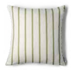
OFFWHITE – GREEN ART NO: 2024-15