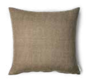
BROWN – NATURAL ART NO: 2024-55