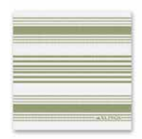
GREEN ART NO: 2024-46