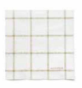
NATURAL ART NO: 2019-38