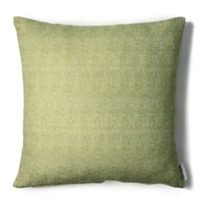
GREEN 138X250 ART NO: 2024-19