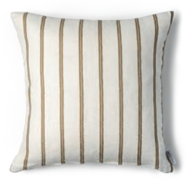
OFFWHITE – BROWN ART NO: 2024-14