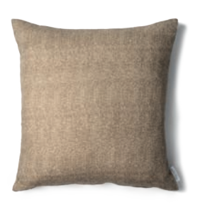
BROWN 138X250 ART NO: 2024-18